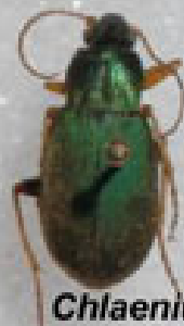
Chlaenius ground beetle