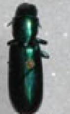
bark gnawing beetle