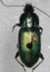
Poecilus ground beetle