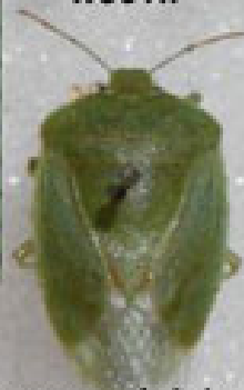
green stink bug