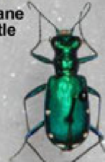
sixspotted tiger beetle